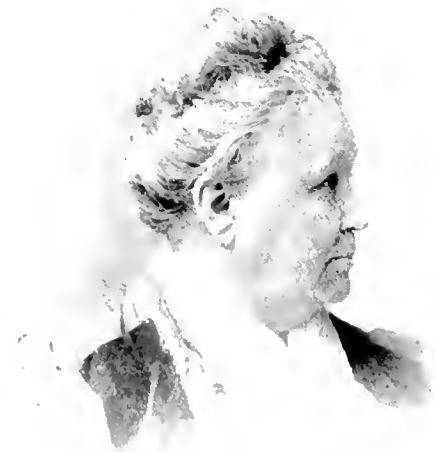
AMELIA E. BARR.